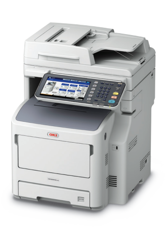
MPS5502mb - 630-sheet standard paper capacity, upgradable to 3,160 sheets; 20-sheet convenience stapler

And, as new applications become valuable to your business, they can be added to your MFP's feature sets using embedded OKI smart Extendable Platform technology.